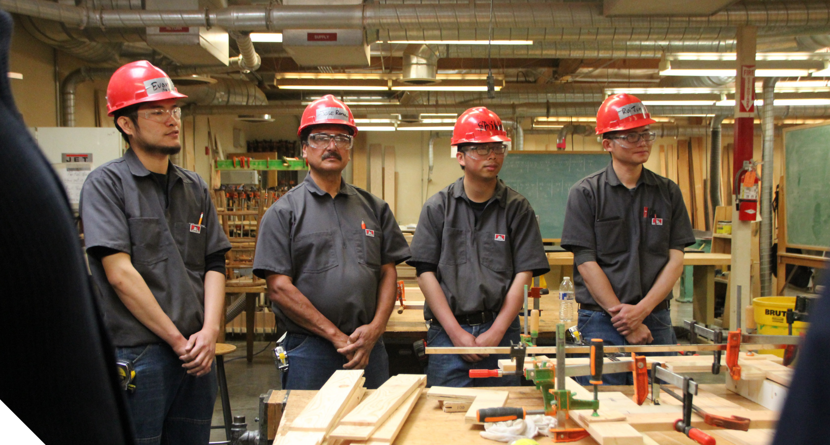
CityBuild participants watch a carpentry demonstration

have a firm understanding of the types of candidates that are a good fit for CityBuild, and they will steer recruits who meet these criteria towards the program. Community organizations provide participants with case management services as individuals move through the program and into a trade. These organizations also stay in contact with recruits during these participants' time in the program and beyond.