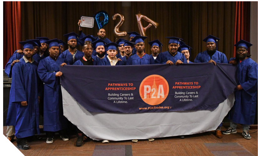
Pathways to Apprenticeship graduation