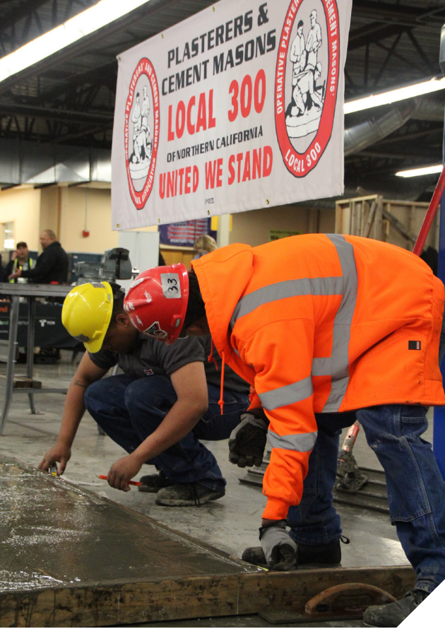
CityBuild participants at Plasterers & Cement Masons Local 300

screening. Any San Francisco resident is eligible for the program, but recruitment efforts target low-income communities with high unemployment rates as well as communities of color.