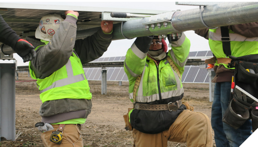
Workers on a solar installation project - Mid-America Carpenters Regional Council