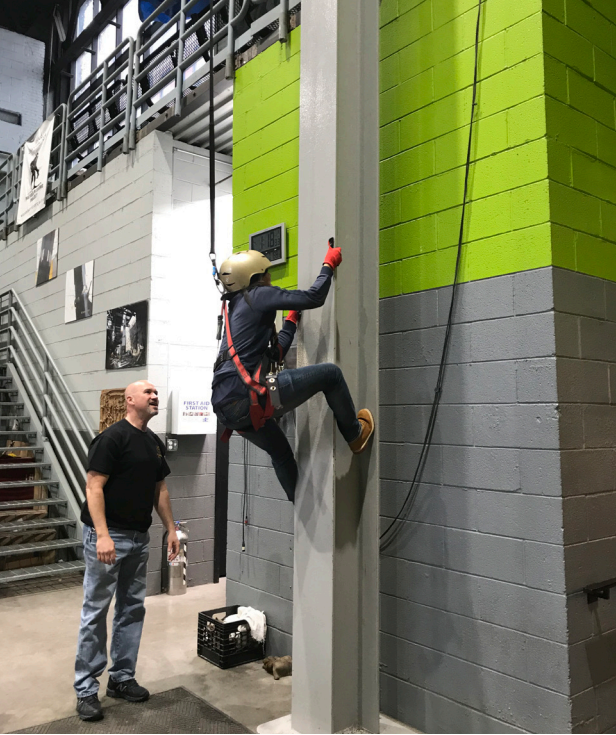
ARC affiliate participant

ARC programs tend to adopt a training model that is cohort-based. The scheduling models dictate programs' length, but most options have the same key elements and overall amount of training in total hours.