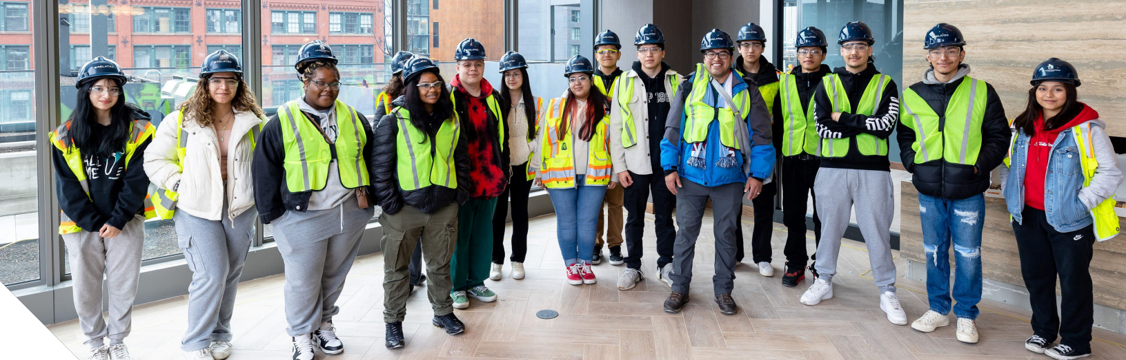
HIRE360 participants on a construction site tour

HIRE360 also helps new contractors build the social capital needed to grow and bid on larger construction projects. For example, the organization helps contractors connect with established minority- and women-owned contractors who can provide guidance for those new to the field and serve as mentors.