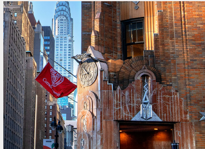
Cornell University, ILR School New York City office, 570 Lexington Avenue

Student Engagement. CJI enriches the ILR and Cornell student experience by engaging undergraduate and graduate students in important aspects of the Institute's core work through fellowships, research assistantships, hands-on clinical experiences, internships, labor-climate undergraduate and graduate courses, and more.