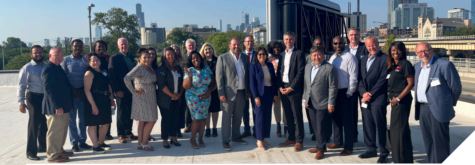
US Labor Secretary Julie Su tours HIRE360's facility