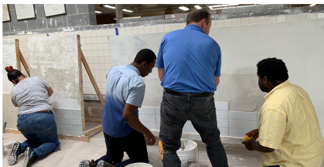
ARC affiliate participants