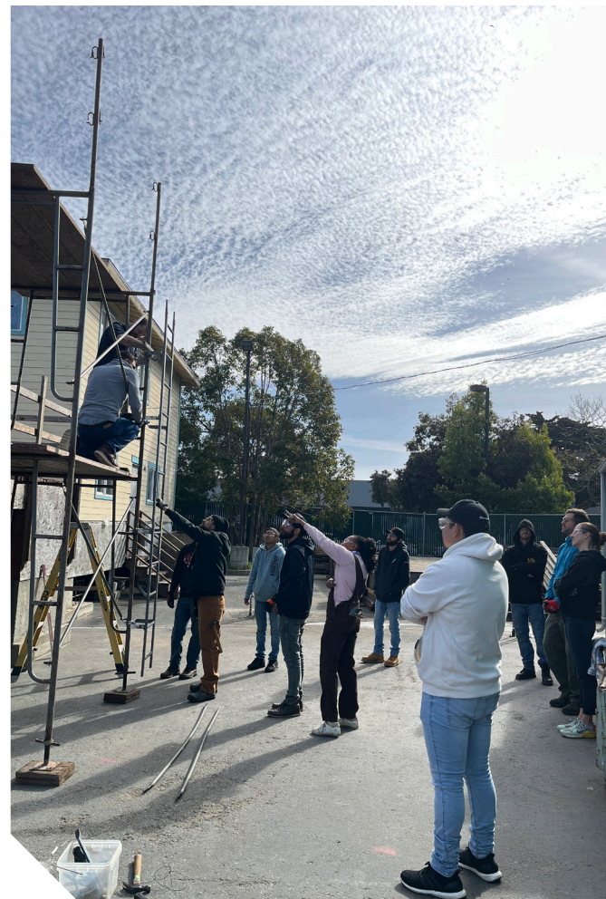
CityBuild participants observe scaffolding demonstration

Given CityBuild’s close relationship to San Francisco’s local hiring mandates, it makes sense to judge CityBuild, at least in part, by the city’s ability to meet the requirements of this ordinance. OEWD releases an annual report listing projects covered by the local hiring law along with the percentage of work hours and apprentice hours that local residents completed. 48 City residents completed 34% of all construction hours and 51% of apprentice work hours in 2022. Both numbers exceeded statutory mandates. The report also breaks down the project hours worked by race. A majority of San Francisco residents who worked on covered projects in the past year were people of color, with Hispanic residents accounting for about 42% of all local workers.