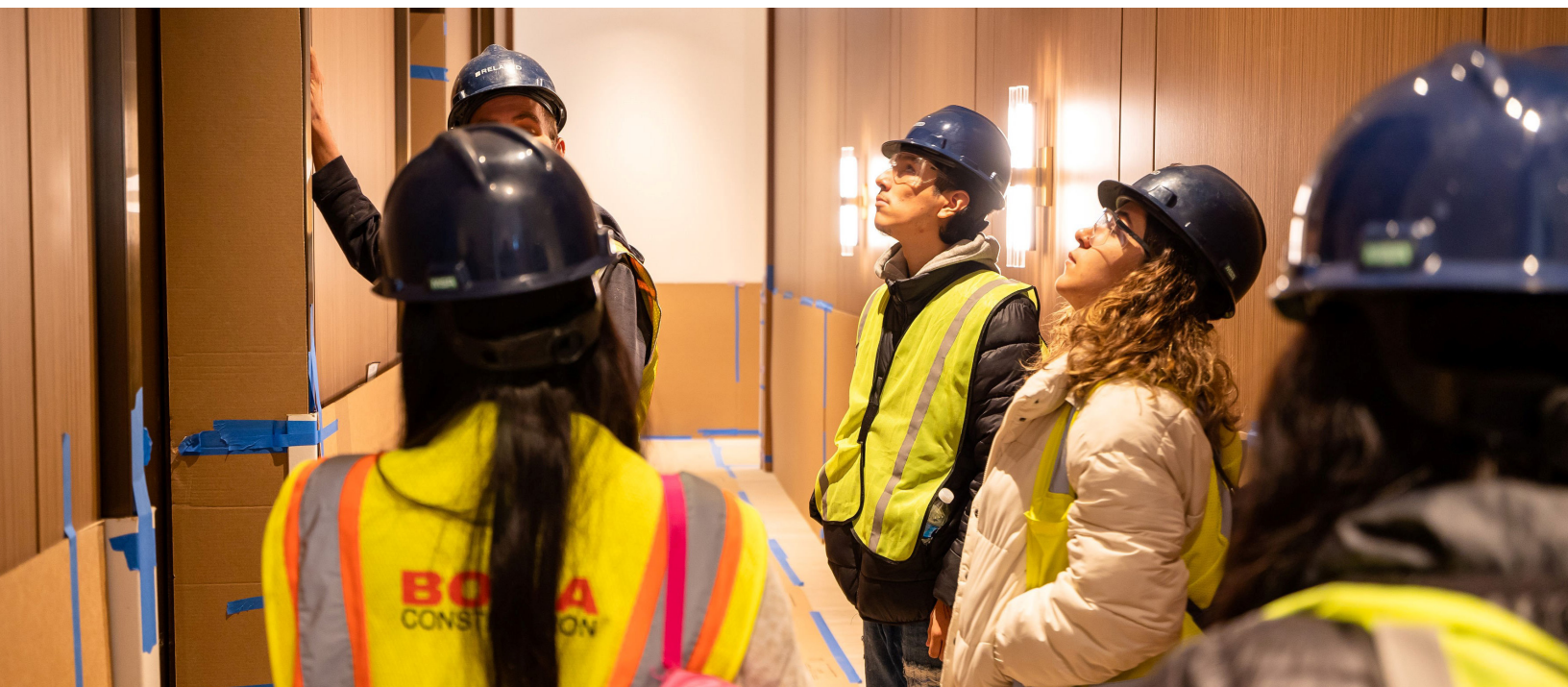
HIRE360 participants tour a construction site

By pursuing this initiative, HIRE360 can help build the capacities of community and workforce development organizations around the state. The organization will also move more explicitly into the clean energy sector, which will be a core source of construction jobs throughout Illinois in the coming years.