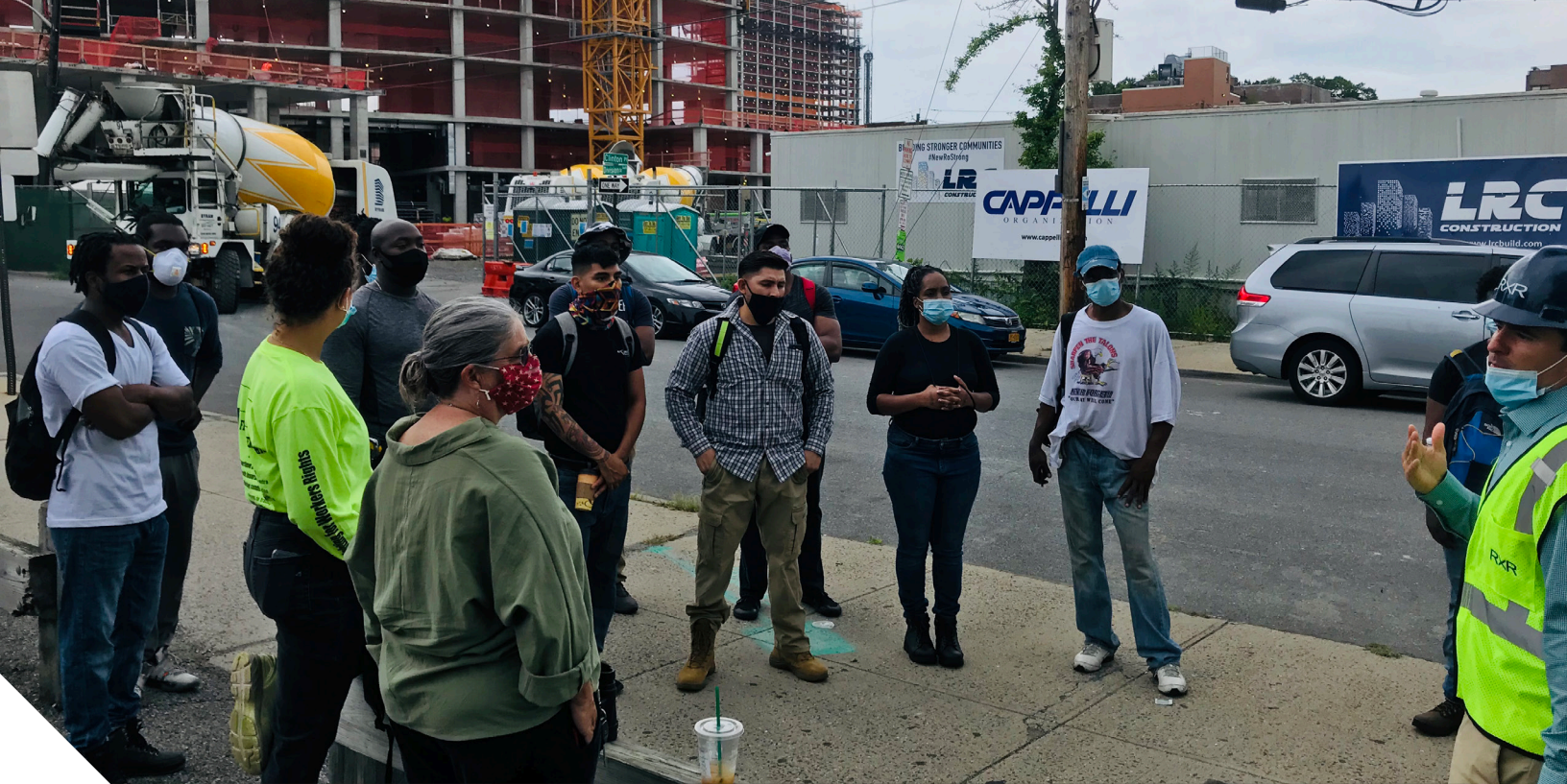
ARC affiliate participants tour a construction site