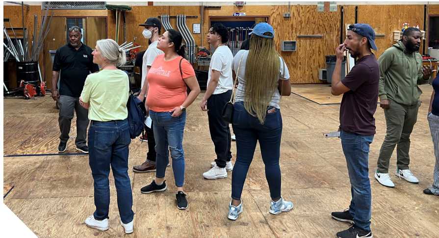
HIRE360 participants touring a joint labor-management training center

Despite losing a participant, staff viewed this outcome as a "success" of sorts. Even though the organization would like to see as many diverse candidates enter the trades as possible, all parties agreed that it is better for someone to discover construction is a poor fit during the early days of apprenticeship readiness. If a person enrolls in an apprenticeship program only to drop out, they have wasted their time. Industry partners, meanwhile, have wasted money on training and