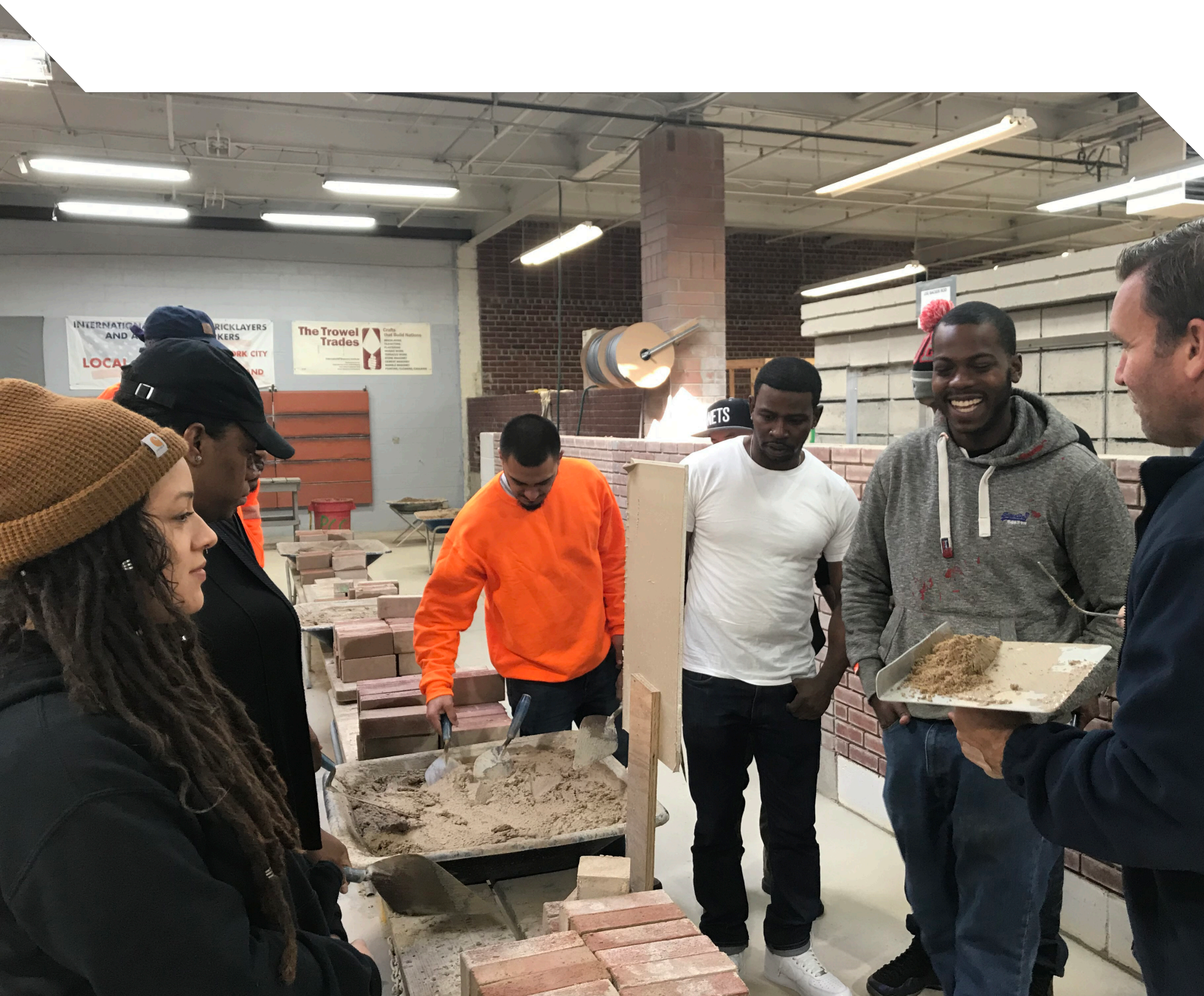
ARC affiliate participants, New York City