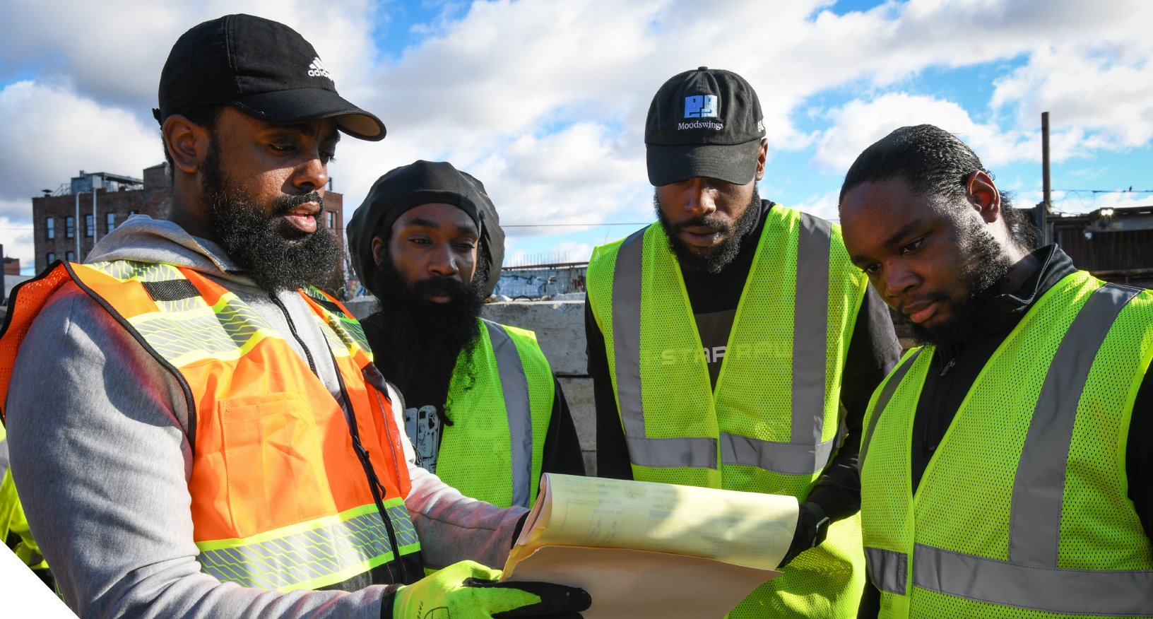
Pathways to Apprenticeship Sanitation Jobs