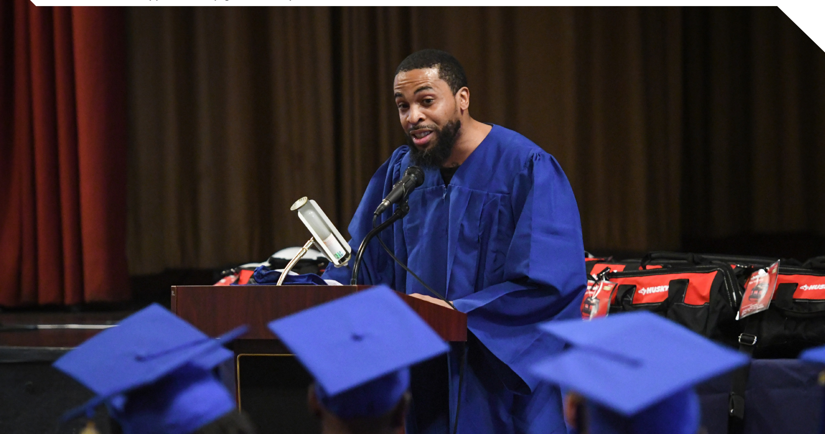
Pathways to Apprenticeship graduation speech

First, one cannot understate how vital financial services are for apprenticeship readiness programs. It is incredibly difficult for low-income individuals to commit to several weeks of training and site visits without some form of financial aid. Programs usually offer stipends, travel vouchers, and the costs associated with starting an apprenticeship (like a basic